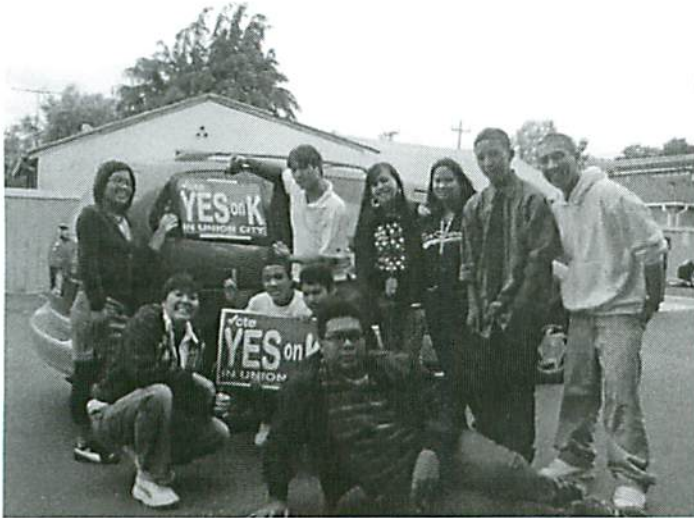
Volunteers convene early on the weekends to precinct walk in Union City.